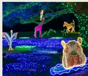
Zoo Lights – Houston Zoo

* Holiday Lights in Memorial Park's Eastern Glades, Dec. 3 – Jan. 1 Zoo Lights –